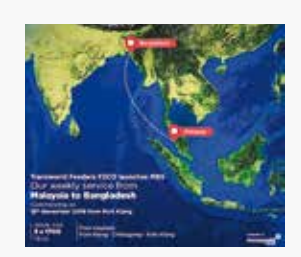
Transworld Feeders launches new service connecting Bangladesh to Malaysia