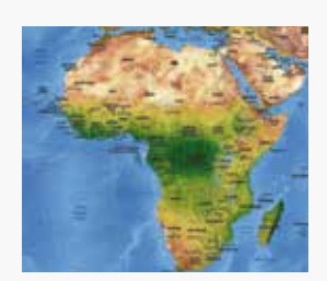
Transworld Group enters into Africa Market