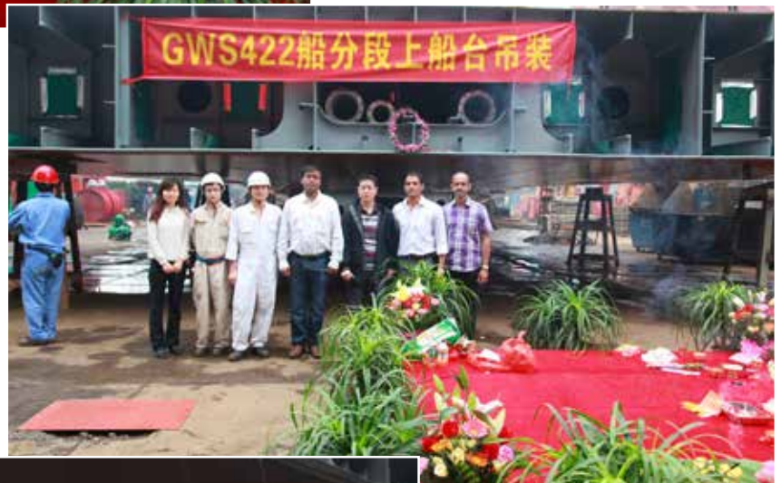
KEEL LAYING CEREMONY ACCOMPLISHED IN PRESENCE OF OEL SITE TEAM & GWS MARKETING DEPARTMENT

The keel laying ceremony for our second new build bulk carrier TBC Princess was carried out last month in the GWS Shipyard. The ceremony was attended by OESM's supervisory team who are onsite at the shipyard.