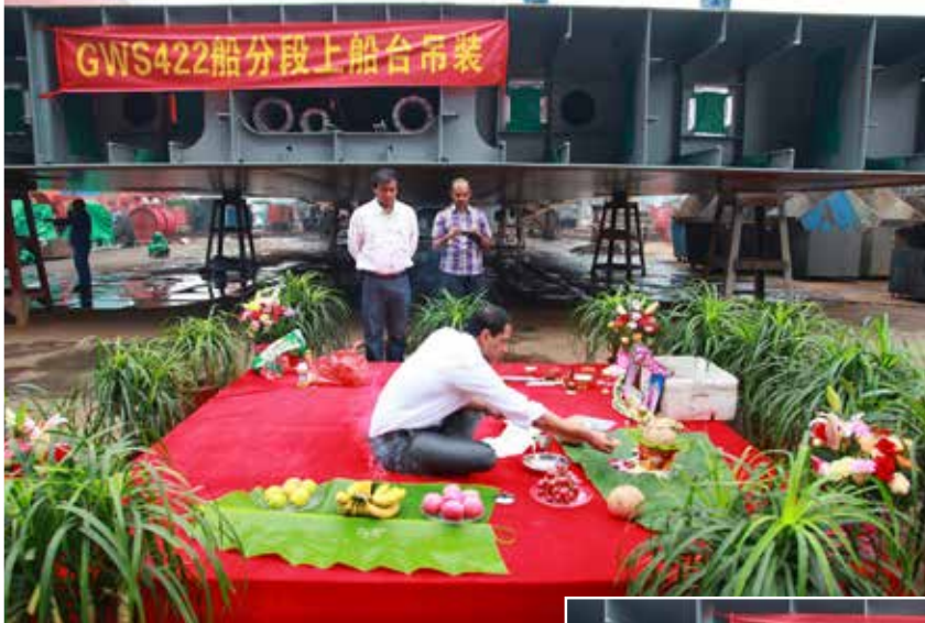
POOJA - KEEL LAYING CEREMONY

The keel laying ceremony for our second new build bulk carrier TBC Princess was carried out last month in the GWS Shipyard. The ceremony was attended by OESM's supervisory team who are onsite at the shipyard.