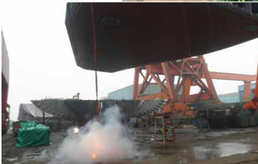
FIRE CRACKERS IN PROGRESS DURING BLOCK LIFTING