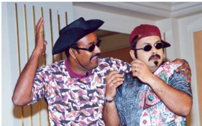
I thought you said nobody would recognize us (2002)