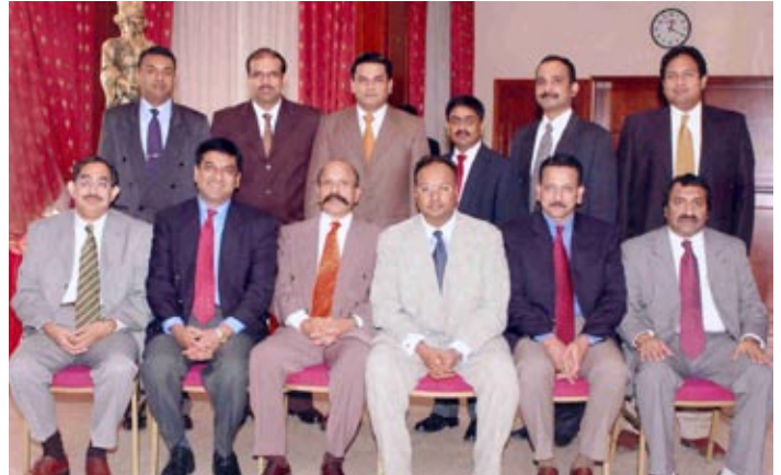
The OEL Team - (2003)