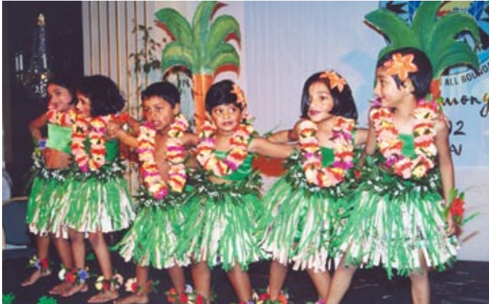
Aloha! and so we danced...(2002)