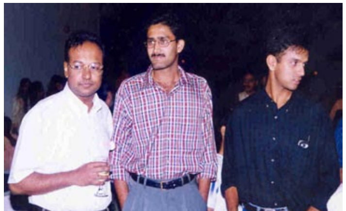
Captains - we are three - (1999)

"Do you want to write or contribute an article, news, tidbits? Please contact any of the co-ordinators.