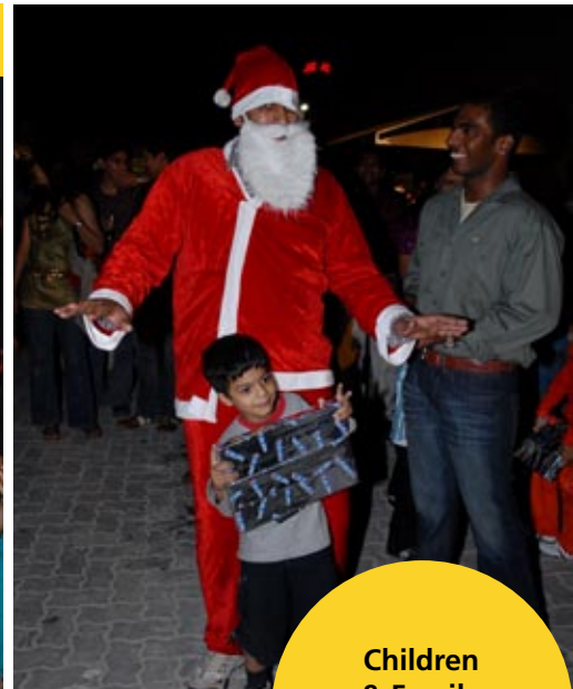
Children & Family with Santa Clause