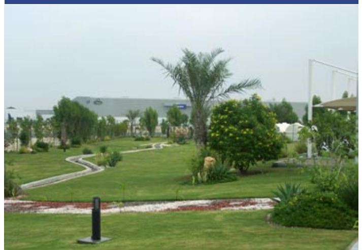
Our Garden of Eden.... 2008