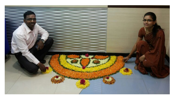
Albatross Mumbai office celebrated Onam by organizing a special lunch for all the employees on Tuesday Sept 17, 2013.