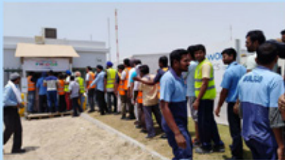
Iftar packing and distribution