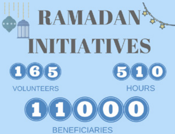
Ramadan Community Fridge