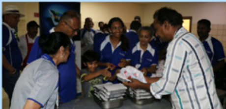
Partnerships Classic Catering Ramadan Sharing Fridges SmartLife