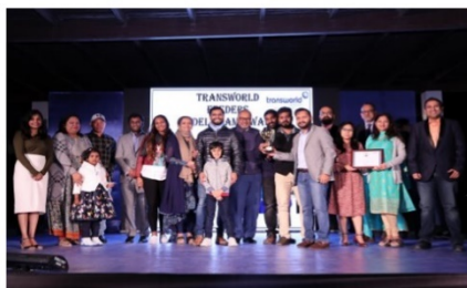
TRANSWORLD FEEDERS FZCO Dubai