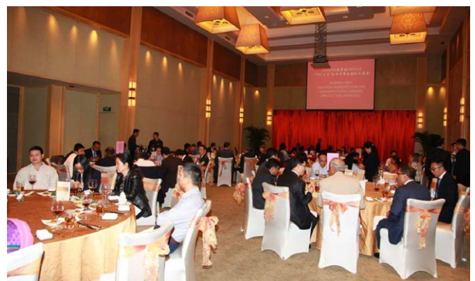
Lunch during Delivery Ceremony