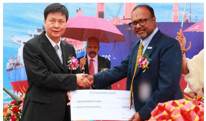
OEL donated GWS USD20,000 for GWS Worker's Fund